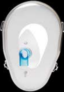
BiTrac SE Shield™