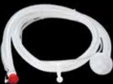
BiTrac™ NIV Circuit